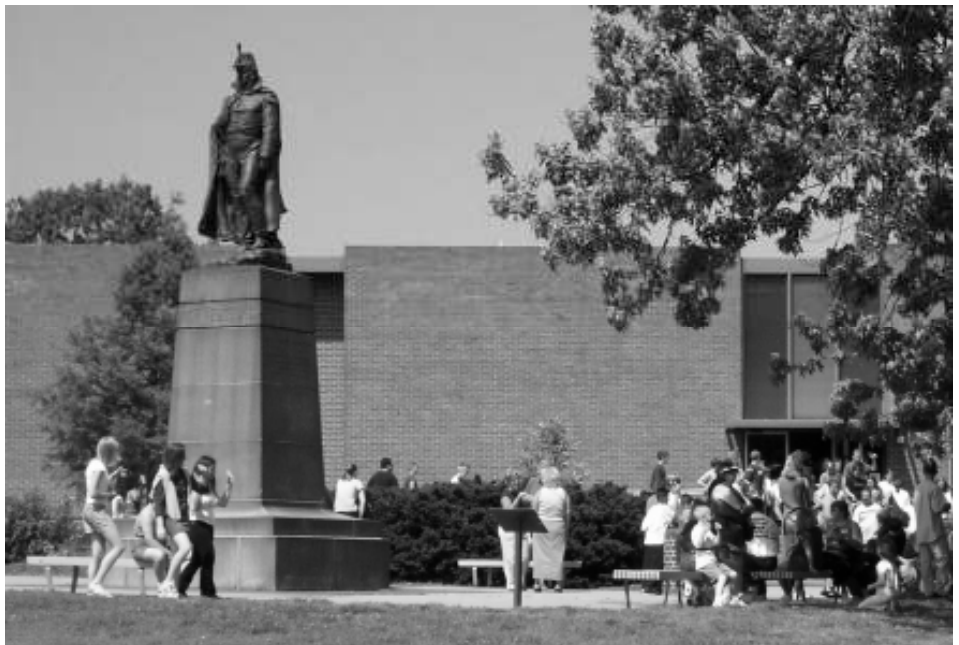
Existing Visitor Center at Fort McHenry National Monument and Historic Shrine

GWWO and Haley Sharpe will present concepts in early 2007. In addition to federal and city funds, the Maryland State Department of Tourism has provided support for the development of the preliminary design.