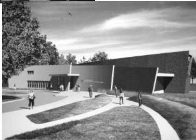
Education and Administration Center

Rendering of the New Education and Administration Center at Fort McHenry National Monument and Historic Shrine.